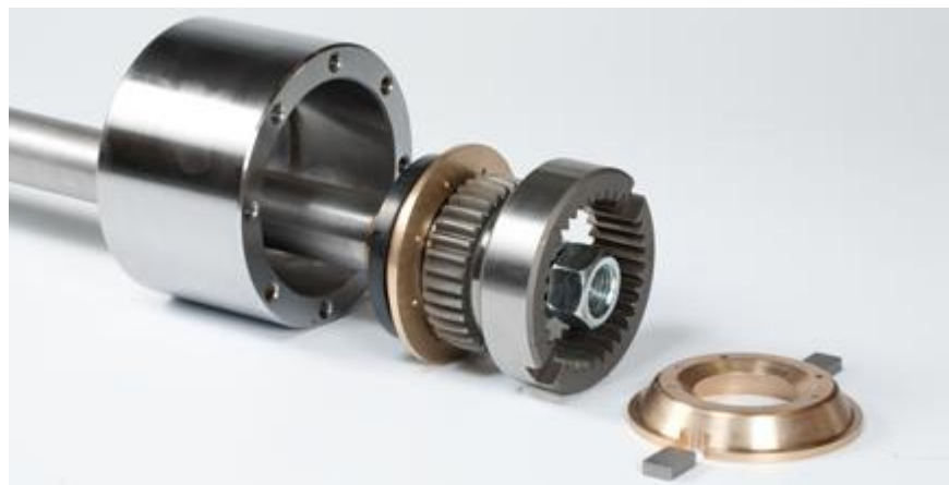
Crown Gear Joint

This model is equivalent to the discontinued Moyno® Centennial SWG Series.